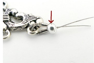
6) Close the crimp cover