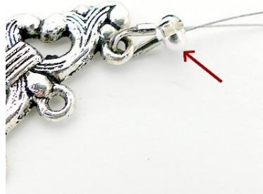
5) Place 1 crimp cover on your crimp bead